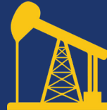
Exploration & Production

For over 36 years, we have provided integrated environmental services that drive value for our clients across North America. We work with the world's leading corporations and government agencies to develop cost-effective permitting, compliance, construction, and operations strategies that carefully balance environmental performance with risk and liability.