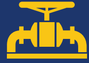
Pipeline & Terminals