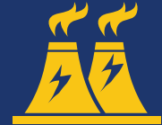
Power & Utilities