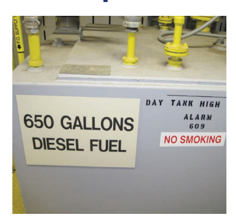
Preparation and certification of SPCC plans for 115 facilities across 15 states for a global telecommunications company