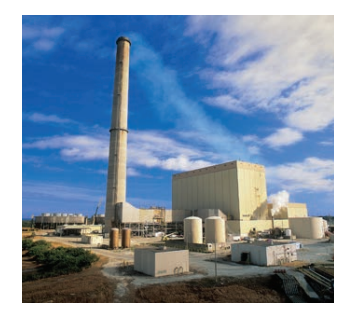
New and updated SPCC plans at 12 power stations across Florida