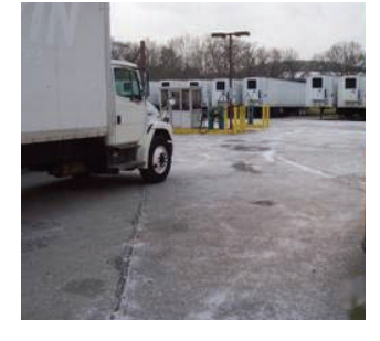
Preparation of new and updated SPCC plans for 400 fueling and distribution facilities across 43 states for a trucking company