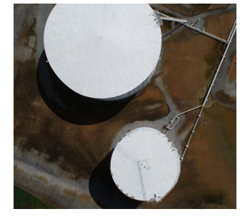
Drone used to assist with secondary containment volume calculation and adequacy determination